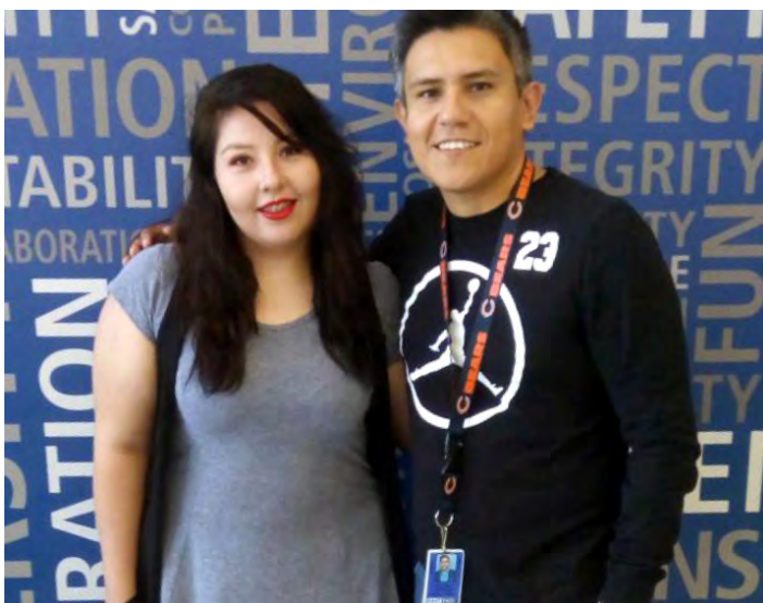
Jabil Chihuahua donated a leg prosthesis to a local university student. (Left)