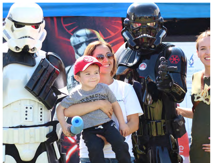
The medical staff joined forces with the Star Wars fan organization at it's Community Health Fair. (Right)