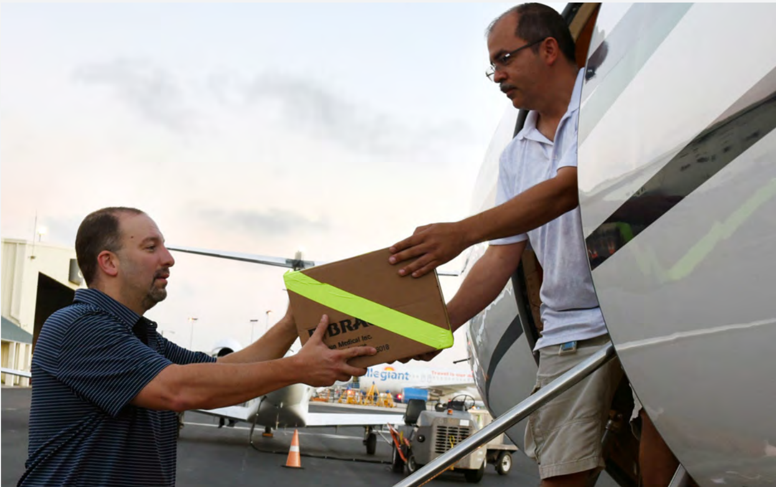
Emergency supplies being delivered from Jabil's corporate plane.

149,100 pounds of water, juice, other drinks and non-perishable food; 34,800 pounds of supplies, including 75 generators, 13,000 batteries, water purification systems, tarps, extension cords, fans, medicine, baby diapers, clothing, sleeping bags, air mattresses, and tents; 3,000 pounds of essential satellite equipment for a customer; and 24,200 pounds of medical supplies donated by All Children's Hospital in St. Petersburg, Doctors of University of South Florida Health and New York University School of Medicine.