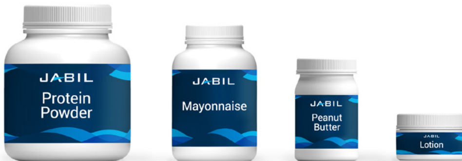
DESIGNED TO FIT INDUSTRY-STANDARD NECK FINISH