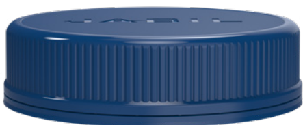
EXTERNAL TAMPER EVIDENCE BREAK AWAY BAND

Jabil's Tamper-Evident Wide Mouth Closure is your next all-in-one solution that optimizes tamper evidence, convenience, and sustainability.