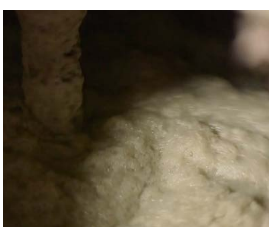
PAPER WASTE BREAKING DOWN INTO PULP FORM