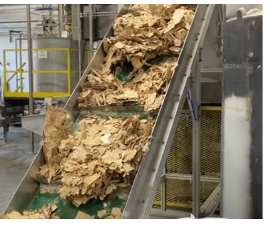
SORTED PAPER WASTE ENTERING PULPER