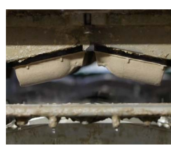
PULP TRANSFORMED INTO DESIRED SHAPE